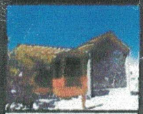
Kelly Bottle House