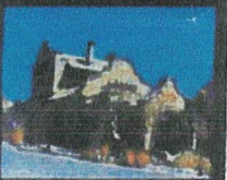
LV & T Depot